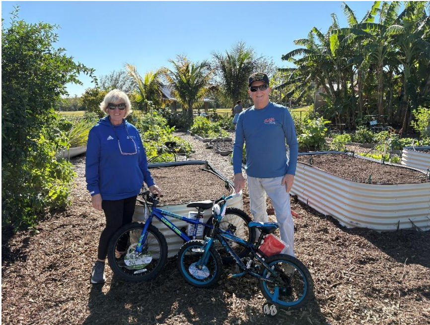
Bike donated by club & a member to the HC Rec Center's Holiday in the Park children's raffle.